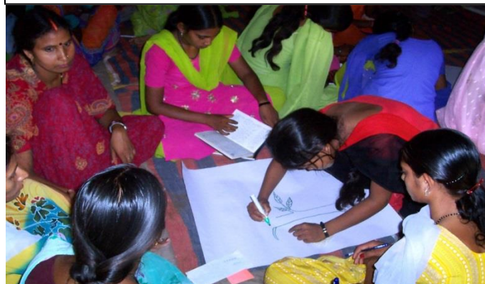
Training and capacity building