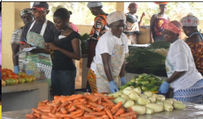
Business models for short food chains