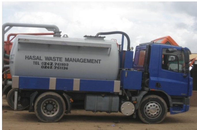
Promoting productive re use of waste and waste water (WASH programme)