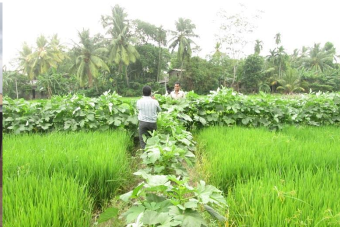
Productive management of flood zones as a climate change adaptation strategy (with UN Habitat)