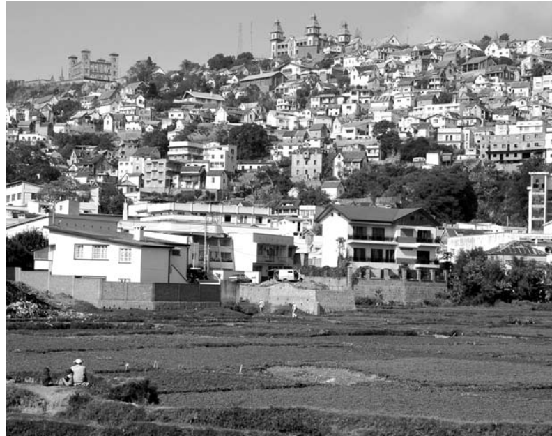
Watercress production in Antananarivo, Madagascar

As a result, the urbanisation process is accompanied by a phenomenon referred to as the “ urbanisation of poverty ”: rural-to-urban migration combined with limited employment opportunities in cities is leading to a shift in the locus of poverty from rural to urban areas. The percentage of the poor living in cities is expected to increase from 30% in 2000 to 50% by 2035 (UNCHS, 2001). A recent World Bank and IMF report based on more than 200 surveys conducted in 90 developing countries showed that the growth in urban poverty was 30% higher than that of rural poverty during the 1993-2000 period. This translated into an additional 50 million urban poor in a period of just seven years (IMF, 2007). The total number of urban poor (those living on less than US$1 a day) in developing countries is estimated at 1.2 billion (UN, 2008). It is common for 30–60% of the population in cities to be in informal settlements with little or no provision of basic infrastructure and services (Hardoy et al, 2001). In most developing countries cities, urbanisation has become virtually synonymous for slum growth. The slum population in these countries almost doubled in 15 years, reaching 200 million in 2005 (United Nations Population Fund, 2007).