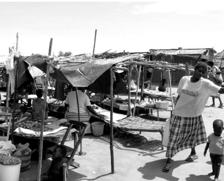
Market in Layamo IDP camp, Uganda

Internal displacement of people in recent years , caused by natural disasters or human-induced emergencies (e.g. Iraq, Georgia, Darfur, Democratic Republic of Congo and Afghanistan) has exacerbated the pressure on urban systems to provide basic services and livelihoods, and accelerated processes of massive slum formation, growing urban poverty, food insecurity, chronic malnutrition and poor health. The recent massive displacement in Pakistan has shown that only 18% of the internally displaced persons (IDPs) are living in camps, whilst 82% are living outside camps, settling mainly in the most marginal and under-served areas of cities. A large proportion of IDPs and refugees often end up living permanently in and around urban areas, even after short periods of displacement (IASC Task Force on Meeting Humanitarian Challenges on Urban Areas, unpublished draft, 2009).