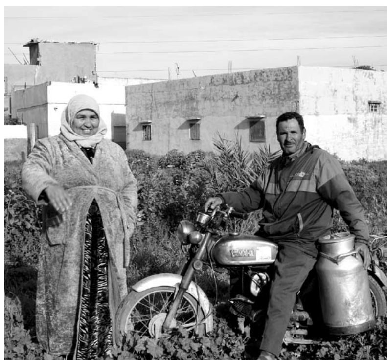
Casablanca small farmers family

explicitly recommends that "Interventions should also include support to increasing food production in urban areas" (page 11) and "A paradigm shift in design and urban planning is needed that aims at: (.....) Reducing the distance for transporting food by encouraging local food production, where feasible, within city boundaries and especially in immediate surroundings. Without sacrificing core principles to observe public health standards, this includes removing barriers and providing incentives for urban and peri-urban agriculture, as well as improved management of water resources in urban areas" (page 17).