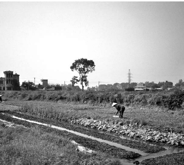
Wastewater irrigation in periurban Hanoi

The main entry points for better waste management and nutrient recycling are the urban households where most losses occur. In particular, reduced septic tank overflow and the comprehensive and timely collection and treat-