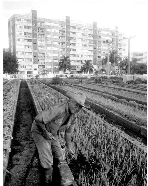
Urban agriculture also produces food for others, Cuba

Production of food (e.g. green vegetables, eggs, milk, and meat from small animals) by poor urban households can supply 20-60% of their total food consumption. Urban households that are generally involved in some sort of farming or gardening have a better and more diverse diet and eat more vegetables than non-farming households of the same wealth class and also more than households from higher wealth classes (who consume more meat). These households are in most cases more food secure than households not involved in urban agriculture. Urban agriculture contributes to diversity in the diet and reduces the urban trend of eating more processed, high-sodium foods (Purnomohadi, 2000; Maxwell and Zziwa 1992; Maxwell et al 1998; Mbiba, 2000; Potutan et al. 2000; Foeken 2006; Yeudall et al 2007; Zezza and Tasciotti. 2008; Motunodzo 2009).