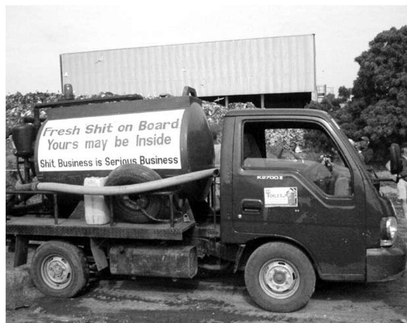
Valuable resources not recovered, Accra

The organic waste component of landfills is broken down by micro-organisms to form a liquid - 'leachate' - which contains bacteria, rotting matter and even chemical contaminants. Leachate can be a serious hazard if it enters a watercourse or a water table. Digesting organic matter in landfills also generates methane, which in large quantities is a harmful greenhouse gas.