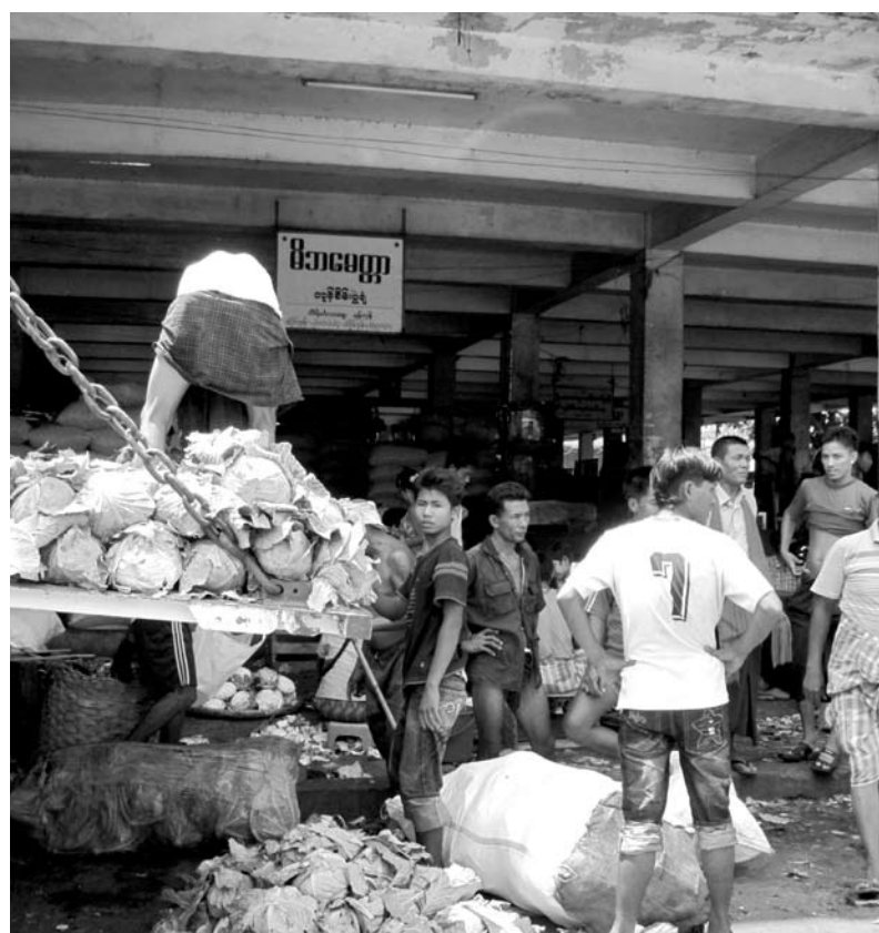
Vegetables being unloaded at Thiri Mingala Market, Yangon