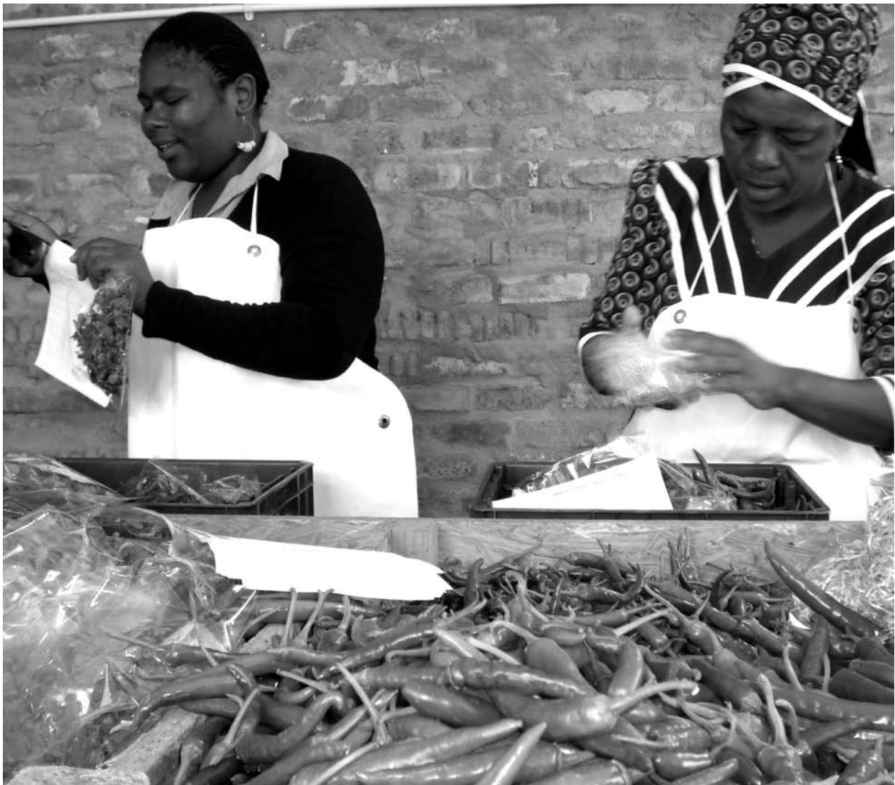
Abalimi / Harvest of Hope staff packing vegetable boxes, Cape Town