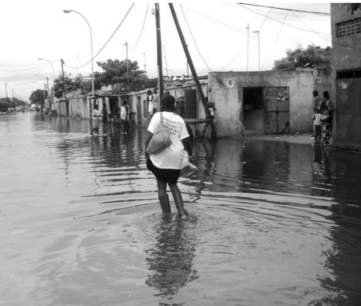
Changing climate increases the risk of flooding

Maxwell et al (2009) point out that the number of people affected by natural disasters is rising due to: (a) the rising frequency and intensity of natural disasters; (b) the increasing concentration of people in vulnerable locations and (c) the diminishing of their coping abilities (especially poor urban) due to malnutrition, poor access to water and sanitation, HIV-AIDS, tuberculosis etc..