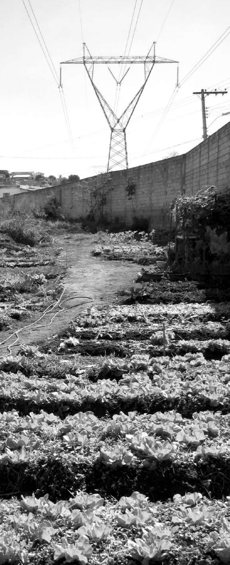
Horta Comunitária da Casa de Apoio – community garden part of the Urban and Family Agriculture Support Programme, Contagem (Brazil)