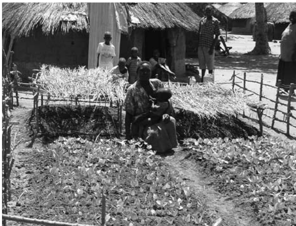
Woman growing vegetables in front of her house, Uganda

Intensive horticulture can be practiced on small plots, making efficient use of limited water and land resources. Horticultural species, as opposed to other food crops, have a considerable yield potential and can provide up to 50 kg of fresh produce per m 2 per year depending on the technology applied. In addition, due to their short cycle, horticultural crops provide a quick response to emergency needs for food (several species can be harvested 60 to 90 days after planting).