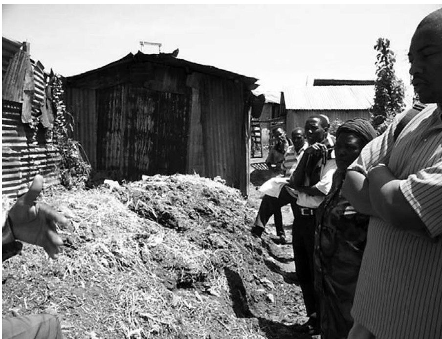
Waste co-composting with manure in Kahawa Soweto in Nairobi

ment (e.g. co-composting) of excreta would significantly reduce the urban environmental impact and provide a substantial amount of nutrients. Solid human excreta contain an average of 19 kg C/p/yr, 0.8 kg N/p/yr, 0.3 kg P/p/yr and 0.5 kg K/p/yr (Drangert, 1998).