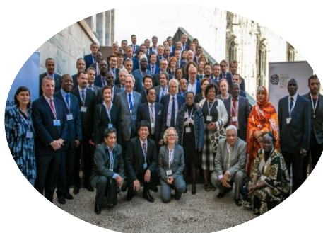
Mayors signing the Milan Urban Food Policy pact