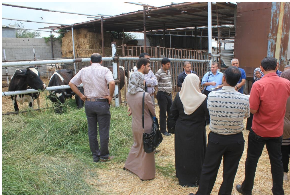
PTD field visit in Gaza

RUAF's Gaza project is a good example of how our work aims to contribute to increasing the Right to Food and food sovereignty for a vulnerable population, by promoting localised systems of production. Since 2013, OXFAM Italy and the RUAF Foundation have been collaborating, under a Swiss Development Corporation- funded project, to promote market-oriented urban and peri-urban agriculture in the Gaza Strip . In 2015, a policy review and analysis of main Gaza and Palestinian plans and strategies bearing on market oriented urban and peri-urban