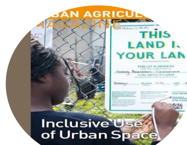
Community participation in land use planning