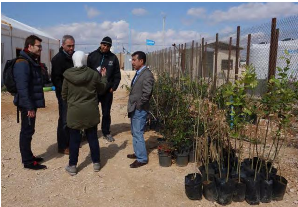
Mission to the refugee camp

RUAF, in collaboration with Spontaneous Cities (SpCiti), International Cooperation of the Association of Dutch Municipalities (VNGI), and the cities of Amsterdam (in Jordan) and Almere (in Lebanon), support both host- and refugee communities the Mafraq governorate and Al Za'Atari refugee camp in Jordan, with small scale agriculture initiatives linked to important issues of waste, water and land management. This programme will be further developed in 2016.