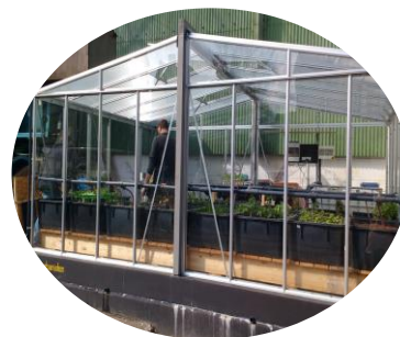
New forms of urban agriculture enterprises

The RUAF network contributes to the development of sustainable cities by facilitating programme development, action planning and research, capacity development and advisory services, policy design, lobbying and advocacy, knowledge management and sharing on urban agriculture and resilient and equitable city region food systems. Read our project highlights here.