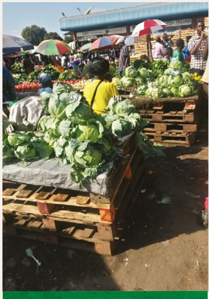
↑ Food market in Kitwe

Currently, the City of Kitwe generates approximately a total of 110,754 tons/year of waste from residential and public places. Residential areas produce about 80% of all waste. While 25,000 tonnes of waste is generated by public places, only 25% is adequately collected, transported and properly