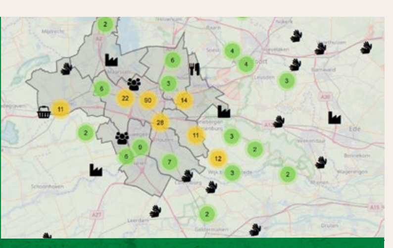
An interactive map of different businesses engaged in local and regional food. http://www.ruaf.org/regionalfoodmaputrecht/

Food processing in the region is largely disconnected from local production. The main food processing sectors in terms of employment (bread and pastry, alcoholic drinks and fish products) primarily depend on inputs from outside the Utrecht region. Some industries, like beer breweries, may have a local marketing strategy. The single largest food processor is a coffee producer (Douwe Egberts). Dairy processing is the largest sector with potential for local or regional marketing, mainly through onfarm processing of cheese. The number of people employed in fruit processing is limited.