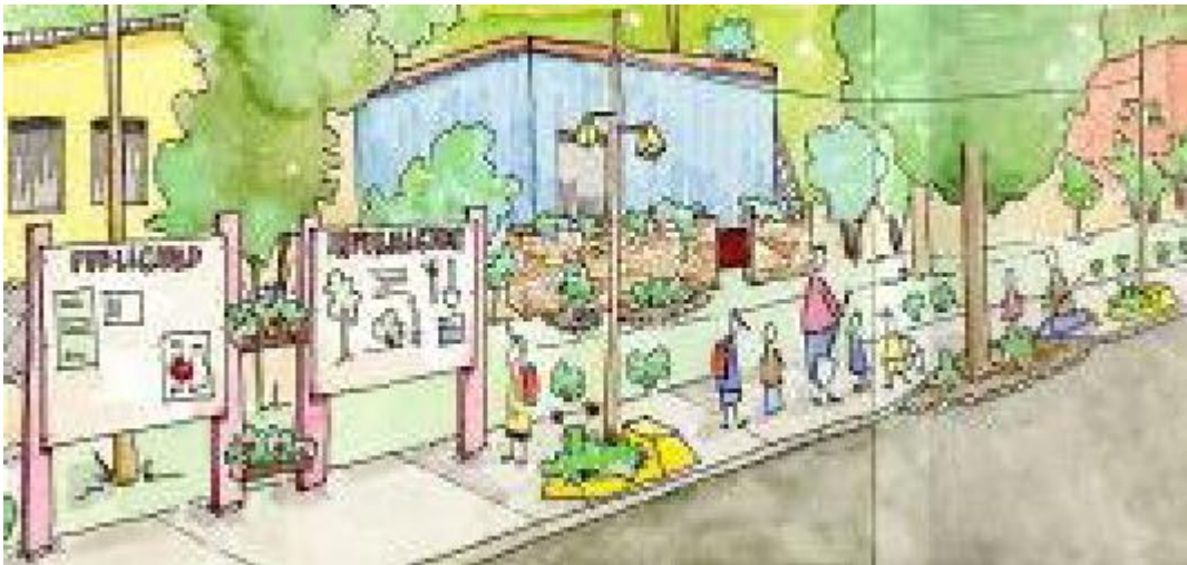
Figure 2.3. Vision of a productive street

obstructing the normal traffic and pedestrian flow.