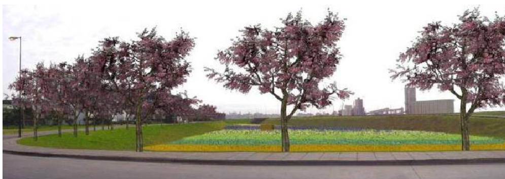
Figure 2.1. Vision of productive garden park “Molino Blanco”